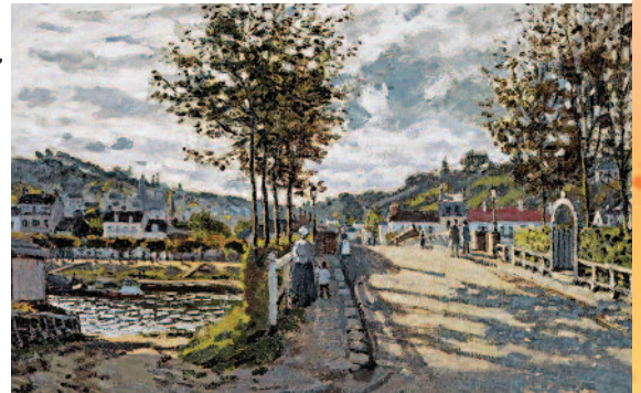
Image credit: Claude Monet, The Bridge at Bougival , 1869, oil on canvas, 25 3/4 in. x 36 3/8 in. Museum Purchase: Currier Funds, 1949.1

The MFA Boston's Cap Martin (1884) is masterful in its rendering of the play of light across the Maritime Alps and the sandy and rocky foreground, and Charing Cross Bridge (1900) is a departure from Monet's fully mature impressionist works, evoking the mood of place without relying on dramatic effects.